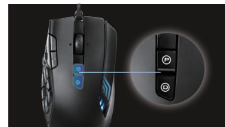
On the fly DPI + 5 Onboard profiles