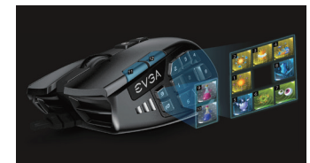
Up to 20 programmable buttons