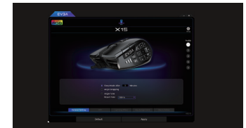
Full control and customization with EVGA Unleash RGB Software