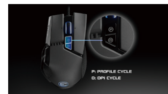
On the fly DPI + 5 Onboard profiles