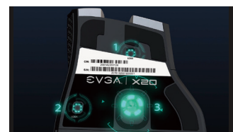
Triple sensor (Pixart 3335 optical sensor + 2 LOD)