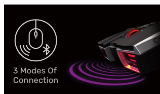
3 Modes of Connection: 2.4GHz / BT / Wired

The X20 delivers customization, precision, and accuracy with the world's first triple sensor mouse. Using dual LOD sensors, paired with a Pixart 3335 optical sensor, the X20 uses an advanced 3-Dimension Array Tech to achieve the shortest and most readings. EVGA's UNLEASH RGB allows you to customize the directions, power-off height, RGB lighting, and it can load five custom profiles for taking settings on the go. The quick responding mechanism uses mechanical torsion and 10 grams of preloaded weight, making the left and right-click more responsive. On the fly DPI and profile, cycling allows changing the settings depending on the situation. 3 modes of connection allow the X20 to be the right mouse for any situation, with a 2.4GHz wireless connection, with 1ms of ultra-fast speed, a multipurpose Bluetooth connection, or a full-speed USB connection while charging. The X20 offers full control and mobility, without sacrificing the competitive edge, as the world's first gaming mouse of its kind.