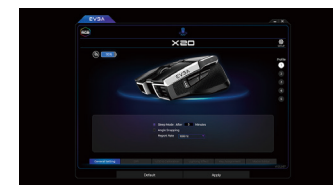
EVGA Unleash RGB Software: Full control and customization with EVGA Unleash RGB Software