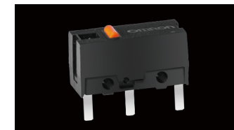
Omron - 60 Million Click Lifecycle