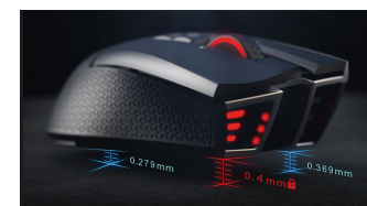
3-Dimension Array Tech