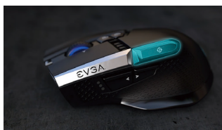
Ergonomic Design with Sniper Button