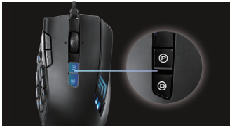
On the fly DPI + 5 Onboard profiles