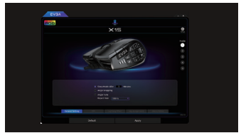
Full control and customization with EVGA Unleash RGB Software