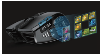
Up to 20 programmable buttons