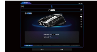
EVGA Unleash RGB Software: Full control and customization with EVGA Unleash RGB Software