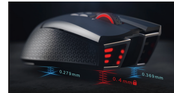
3-Dimension Array Tech