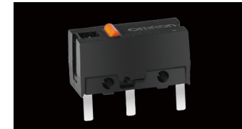
Omron - 60 Million Click Lifecycle