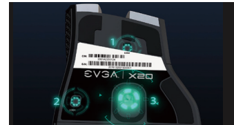
Triple sensor (Pixart 3335 optical sensor + 2 LOD)