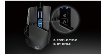
On the fly DPI + 5 Onboard profiles