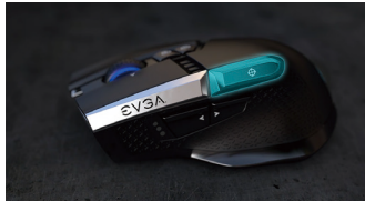
Ergonomic Design with Sniper Button