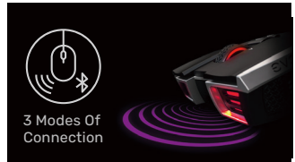
3 modes of connection: 2.4GHz / BT / Wired