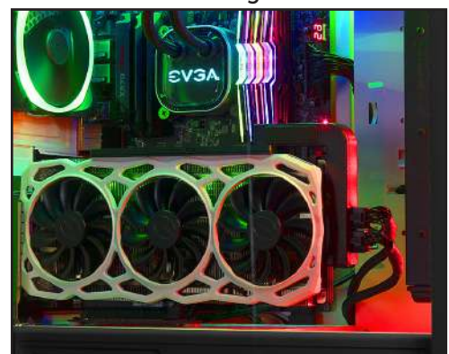
Full RGB Control