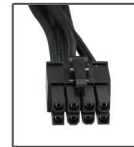
2X 8 Pin EPS12V