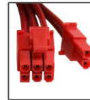
16X 6+2 Pin PCI-E