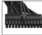
1X 24 Pin ATX

You can also count on EVGA to provide the utmost reliability and performance, with 100% Japanese capacitors and a durable ball bearing fan. The NEX1500 Classified is designed from start to finish to be the best choice for today's most demanding high-end computers. Get to the next level with the EVGA NEX1500 Classified Power Supply!