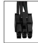
3X 6 Pin PCI-E