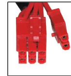
4X 6+2 Pin PCI-E