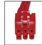
4X 6 Pin PCI-E