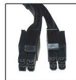
2X 4+4 Pin EPS12V