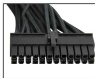
1X 24 Pin ATX

You can also count on EVGA to provide the utmost reliability and performance, with 100% Japanese capacitors and a durable 2-ball Bearing fan. The NEX750B Bronze is designed from start to finish to be the best choice for today's most demanding enthusiast computers. Bring your A-game with the EVGA NEX750B Bronze Power Supply!