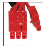
4X 6+2 Pin PCI-E