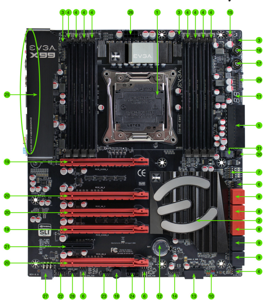
FIGURE 1. X99 FTW Motherboard Layout

The EVGA X99 FTW Motherboard with the Intel X99 and PCH Chipset. Figure 1 shows the motherboard and Figure 2 shows the back panel connectors