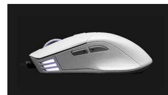
Light weight body for quick flicks