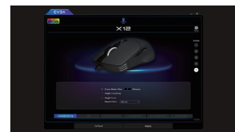
Full control and customization with EVGA Unleash RGB Software