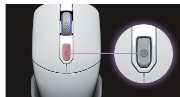
On the fly DPI + 5 Onboard profiles