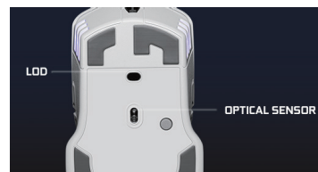
2-Dimension Array Tech : Dual sensor (Pixart 3389 optical sensor + 1 LOD)