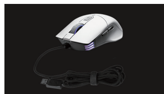
Paracord USB cable