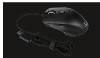
Paracord USB cable