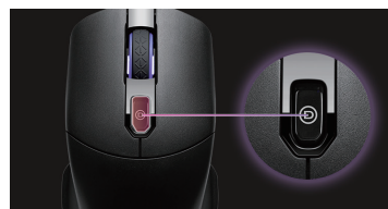
On the fly DPI + 5 Onboard profiles