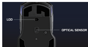
2-Dimension Array Tech : Dual sensor (Pixart 3389 optical sensor + 1 LOD)