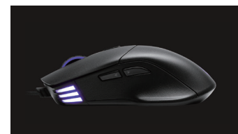
Light weight body for quick flicks