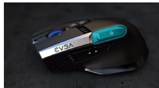
Ergonomic Design with Sniper Button