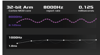
High Speed USB Connection: 32-bit Arm Cortex-M33 core USB microprocessor, supporting a native 8000Hz report rate