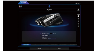
EVGA Unleash RGB Software: Full control and customization with EVGA Unleash RGB Software