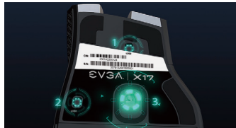
Triple sensor (Pixart 3389 optical sensor + 2 LOD)