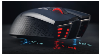
3-Dimension Array Tech