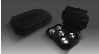
Weight System: Up to additional 25 grams