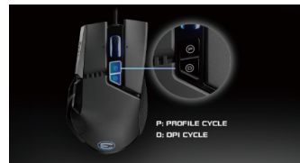
On the fly DPI + 5 Onboard profiles